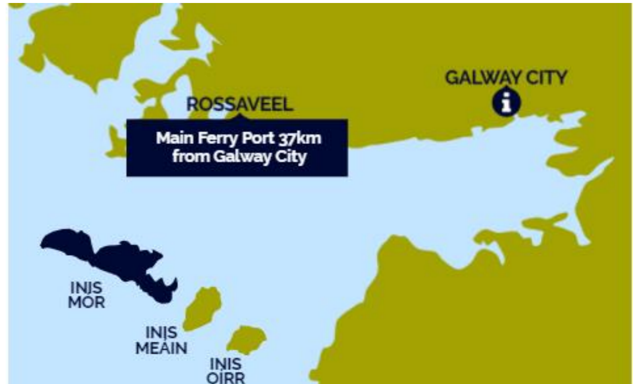
Aran Islands and Departure Points