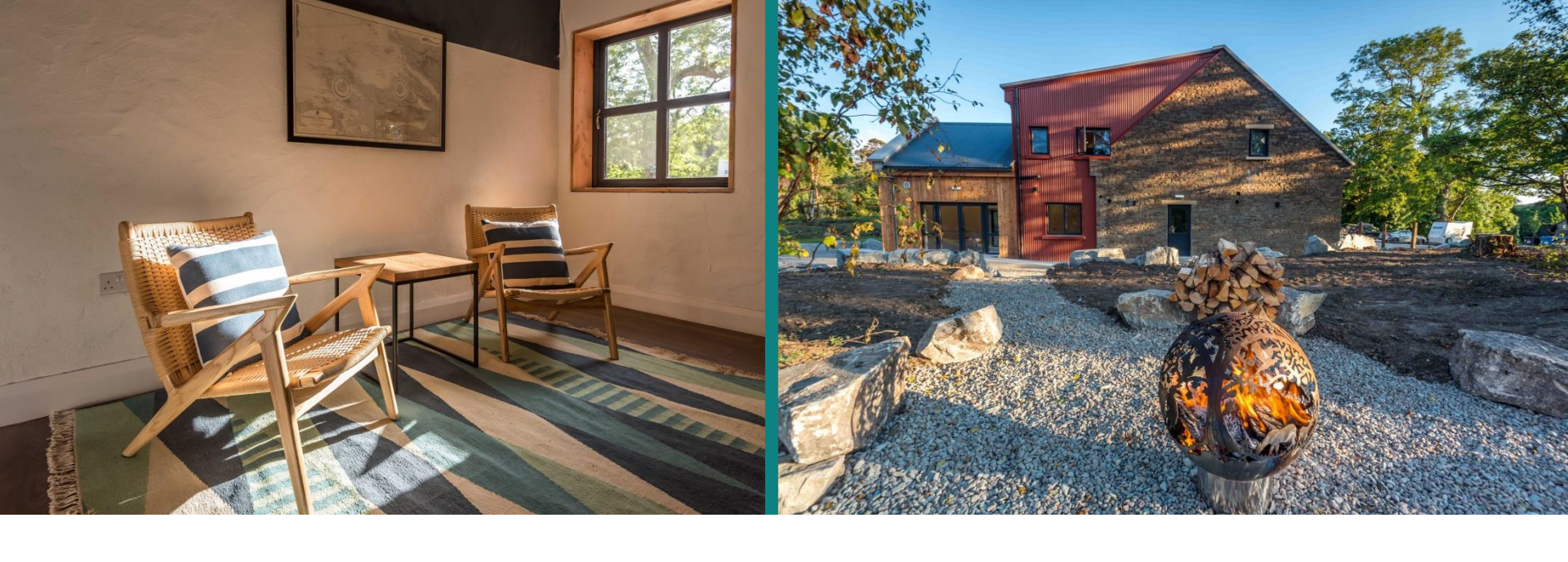
CONFERENCE ROOM & MEETING FACILITIES | 2 OUTDOOR FIRE PITS | DINING FOR 40