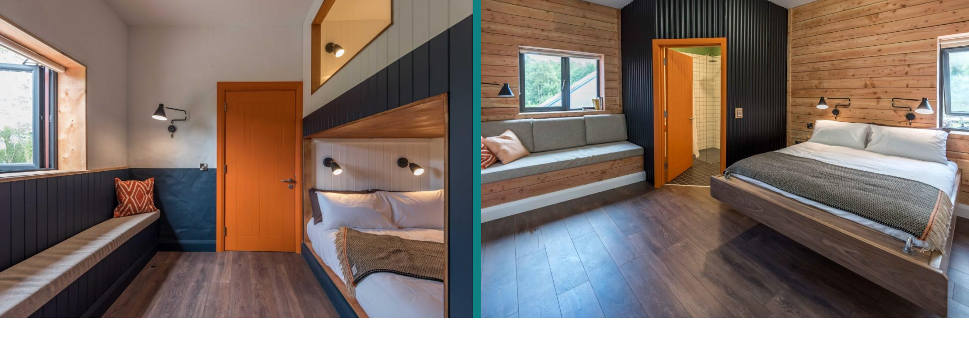
10 BEDROOMS | FLEXIBLE CAPACITY | ALL EN-SUITE | EACH ROOM INDIVIDUALLY DESIGNED